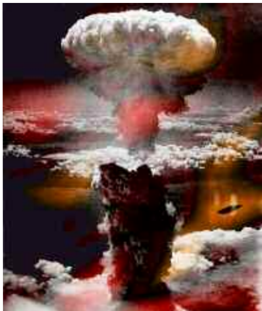
August 9, 1945. Atomic mushroom in Nagasaki. The power of this bomb was three times of that dropped on Hiroshima, August 6th.

70% of Japanese Catholics lived in Nagasaki. Nagasaki and Hiroshima were the cities in which almost all the Catholics of Japan lived. So, yes, the first two US atomic bombs were, dropped on the “yellow race,” but also, TO KILL ALMOST ALL THE CATHOLICS OF JAPAN!