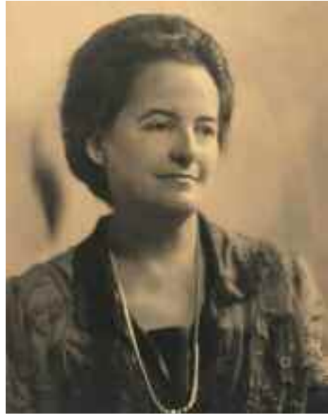
Alice Bailey, a priestess of the “New Age”, was the founder of the “Lucifer Trust” (The Court of Lucifer) that directs the UN.

One can deduct who this “ God of Love ” is that Alice Bailey referred to by the international Masonic-Satanic organization founded by her: the “ Lucifer Trust ” (= the Court of Lucifer), then, more prudently called “ Lucis Trust ,” which directs the UN. About this “new religion”, Bailey writes: « The Risen Christ and not the Crucified Christ will be the distinguishing feature of the new religion .»