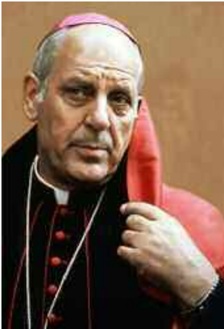
Msgr. Paul Marcinkus, the “Long Arm” and “shadow” of Paul VI.

«At the time of the so-called “Pizza Connection,” in the early 80s, my “Family” (the Mafia) and other “Families” of Palermo, thanks to heroin, earned billions, giving rise to the new mafia bourgeoisie. We bought raw morphine from the Turks, refined it in Sicily and, after having transformed it, sold it.