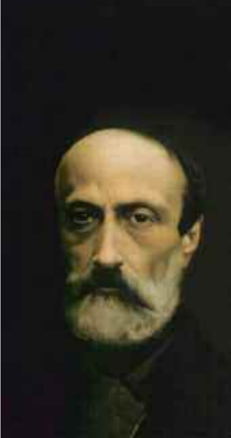
Giuseppe Mazzini, Head of Political Action of the Illuminati of Bavaria, founded the P2 Lodge which means: Palladian Ritual 2.

sire to make Christ the Supreme Leader in place of the Monarchy.