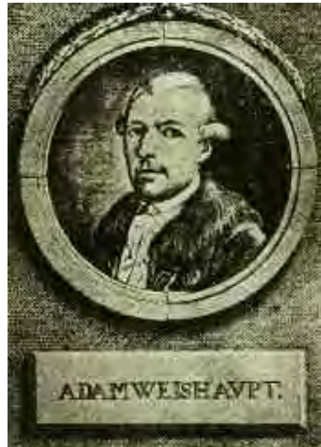
Adam Weishaupt, founder of the Order of the Illuminati of Bavaria, pointed out the family as the greatest enemy to defeat.

History shows that the Nobility and the Clergy of France, before the French Revolution, unanimously promised freedom to the press, to workers, to religions and had renounced their privileges and also in-