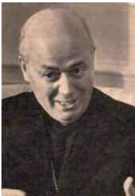
Card. Giovanni Benelli.

“ Supreme Commission ” ... at whose summit, there is a “ Super Triumvirate ” whose members are elected by secret ballot and hold office for life. The decisions of these figures of absolute power, once made, are no longer debatable.»