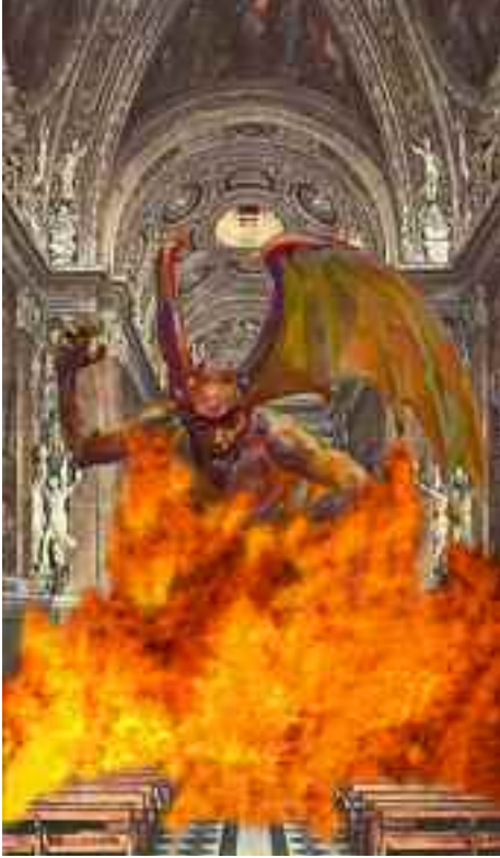
The Kingdom of the Antichrist began with the Double Black Mass in Rome and in Charleston (USA) that enthroned Satan in the Vatican.

did not save any aspect of Dogmas, of Morals, of the Liturgy, of Discipline, itself. The fifteen years of the pontificate of Paul VI saw the birth and development of the “House of Man on Earth” or rather of the “New Universal Church of Man” inspired by Satanism. This was the “New Church of Paul VI” which, according to the words of Our Lady of La Salette, as “a black body” would “eclipse” the Church of Christ, the “shining body.”