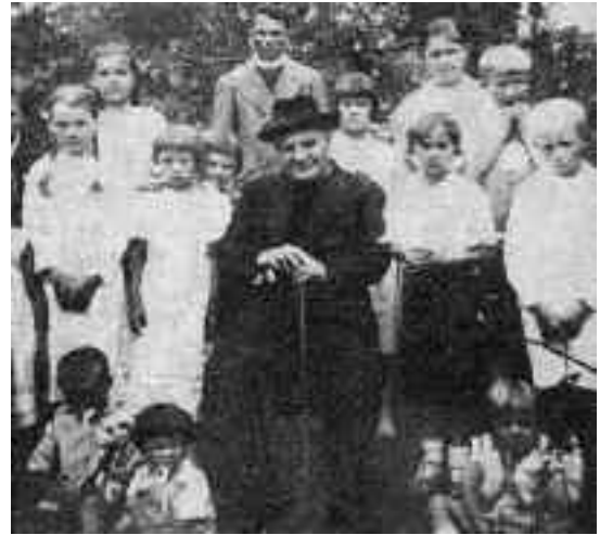
Roncalli in Bulgaria among young refugees. Roncalli was a pedophile and was initiated into the Rosicrucian sect, an Illuminati Society.