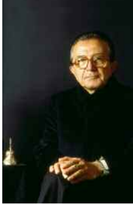
The Hon. Giulio Andreotti.