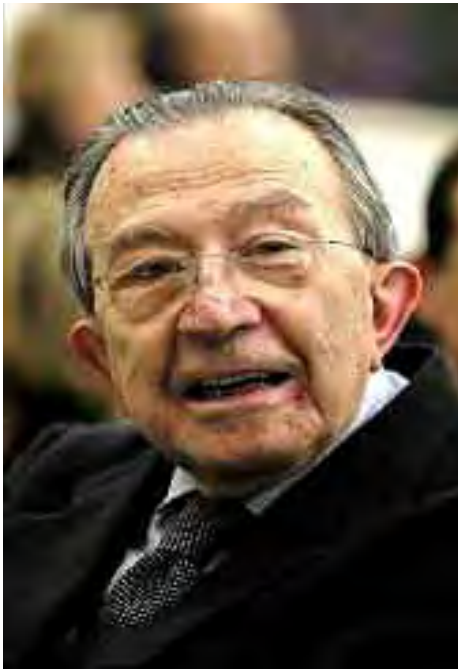
The Hon. Giulio Andreotti.