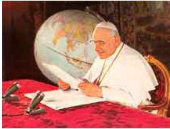
John XXIII, Masonic Antipope, chosen and imposed by Freemasonry.

Almost unnoticed by the faithful, during this “Cold War” orchestrated confrontation between the Soviet Union and the United States, was another show of strength that took place in the first days of Vatican Council II. The initial traditional preparatory plans of the Council, which had been painstakingly organized for two years by a group of Orthodox prelates under the guidance of Archbishop Domenico Tardini, were dumped into the garbage can, to make way for a radical revolutionary program. A new series of schemes, tailored to the anti-Church, and secretly drafted by the agents of the Synagogue of Satan, long before