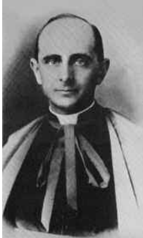
Msgr. Montini in the '30s.

From the archives of the Italian Ministry of the Interior, it appears that the FUCI National Ecclesiastical Assistant, Msgr. Montini , had been caught, with a person of the same sex,