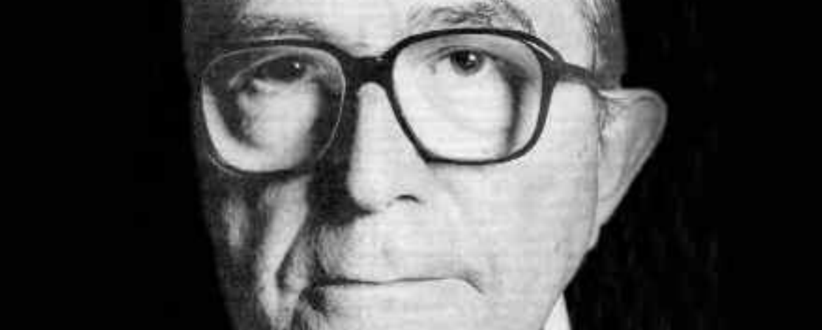
The Hon. Giulio Andreotti.